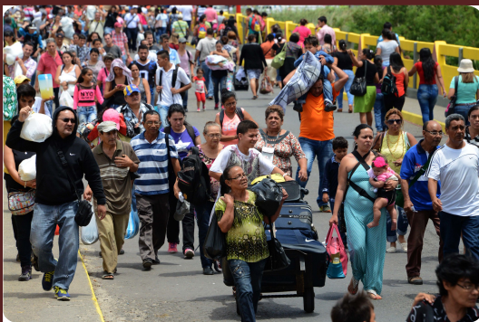
Global – Solidarity in a COVID-19 World: CJJ Fall 2021 Campaign