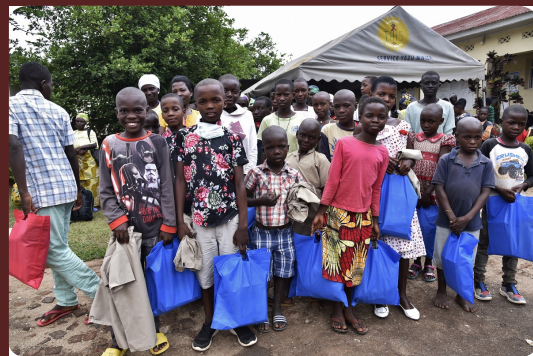
Burundi – Over 1300 OVC students receive school kits!!!