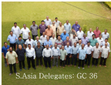
S.Asia Delegates' GC 36

The Provincials and Regional Superiors of South Asia reflected on the situation and have mandated to themselves and to the assistancy, commitment to effectively respond to the forces of fundamentalism through all their ministries. The statement says, "Any Jesuit Response is founded on our mission to promote justice and reconciliation in our broken world of which dialogue with the poor and with people of other cultures and religions is an essential part. Our mission as Jesuits in South Asia is to build counter-cultural human communities of solidarity that will be instruments of peace and reconciliation to respond to the danger of this region turning into a region of hate and violence. To remain silent spectators in the midst of this onslaught on the Constitutional values of equality and fraternity, secularism and pluralism is to betray our mission. Our response must be in collaboration with men and women of good will and through networking with civil society and other organizations that share our values". Download Statement.