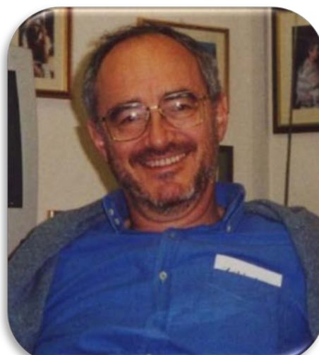
Fr. Michael F. Czerny SJ (1992 - 2002)