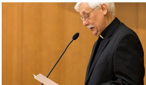
Global - Arturo Sosa: Democracy could be among the victims of Covid-19